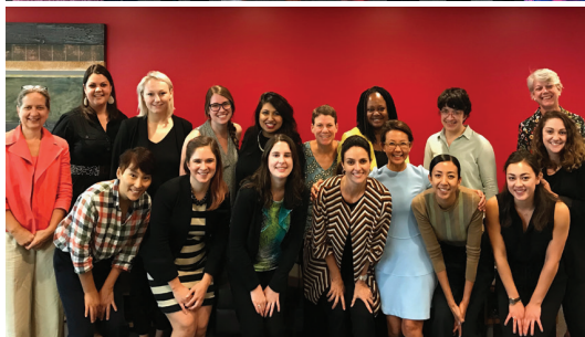
L to R Top: 2015 DMZ Crossing, Paju, South Korea ; Campaign partners retreat, Sonoma, CA, July 2018. L to R Bottom: 2020 Campaign meeting, New York City, September 2018; Washington, D.C. Working Group meeting, September 2018.