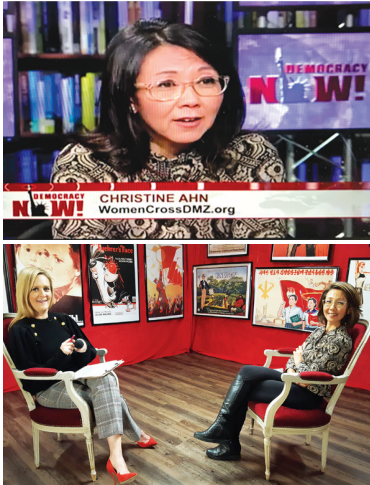
L to R Top: Democracy Now!; AM Joy on MSNBC. L to R Bottom: Full Frontal with Samantha Bee; BBC World News.