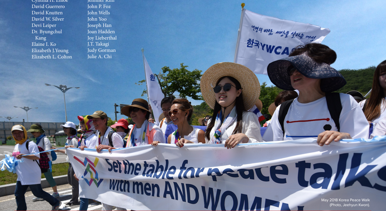
May 2018 Korea Peace Walk.